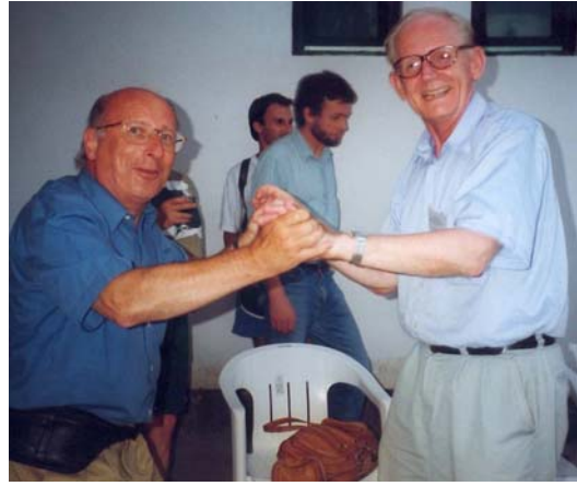
Laughing with him was a fantastic medicine.